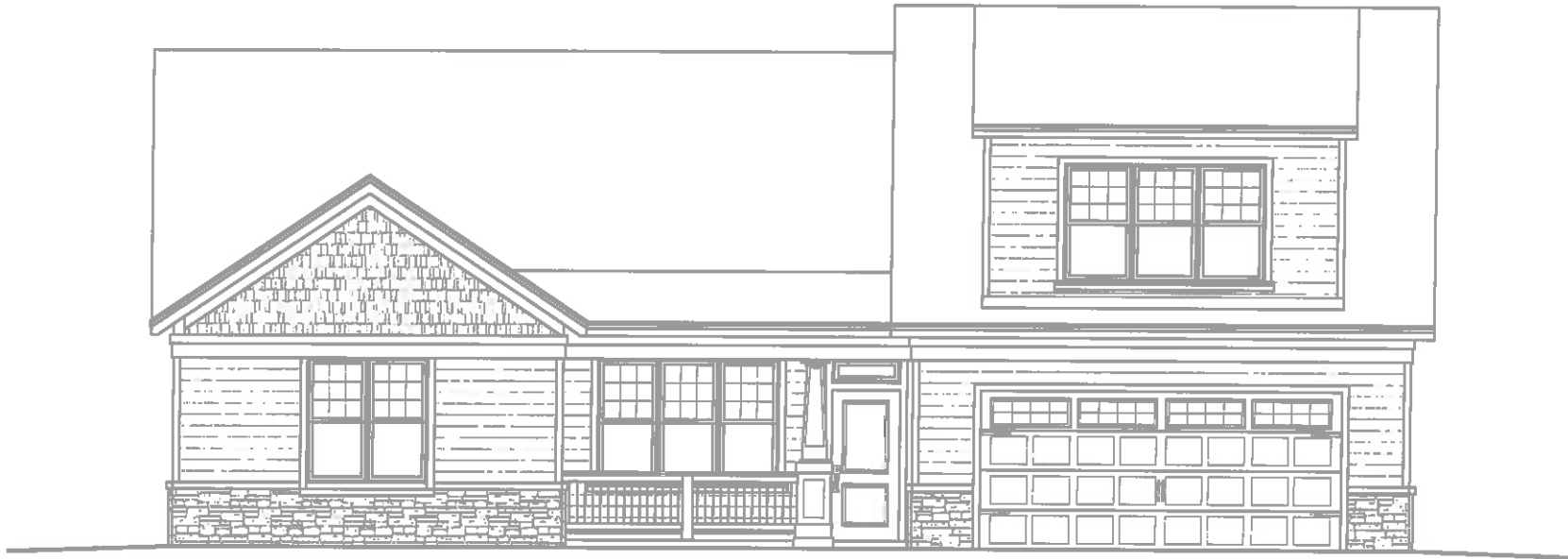
FRONT ELEVATION SCALE: 1/8" = 1'-0"

Upper Level Heated: 362 sq.ft. Main Level Heated: 1,643 sq.ft. Total Heated: 1,995 sq.ft. Garage: 444 sq.ft. Porch: 86 sq.ft. Covered Patio/Deck: 86 sq.ft. Open Patio/Deck: 133 sq.ft. Roof Peak: 23'-8" Foundation Perimeter: 205'-4" Linear Feet 1.5 - Story